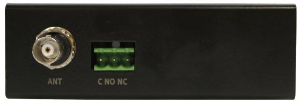
NTS100 Top View