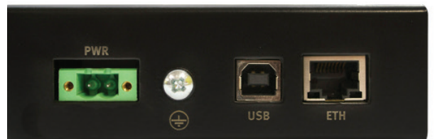
NTS100 Bottom View